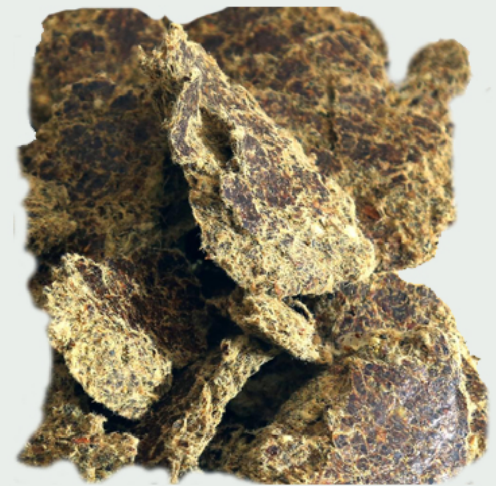
Cotton Seed Cake