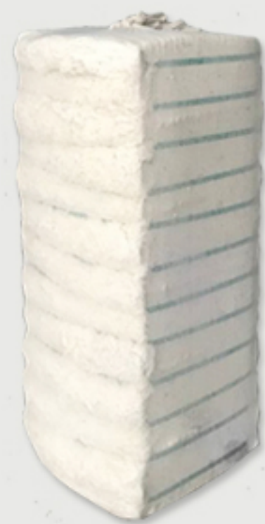
Process Cotton Bales