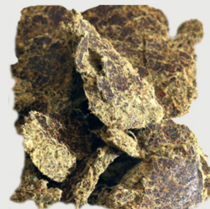
Cotton Seed Cake