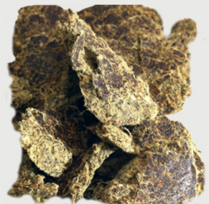
Cotton Seed Cake