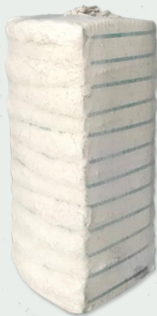
Process Cotton Bales