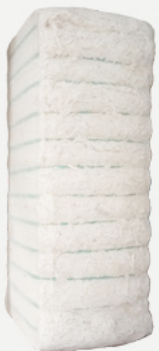
Process Cotton Bales